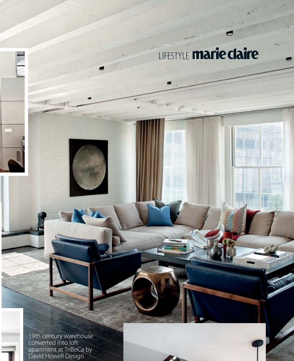
19th century warehouse converted into loft apartment at TriBeCa by David Howell Design