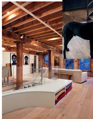
Mabbott Seidel Architecture connected the upper and lower floors of a TriBeCa loft duplex, while retaining light and view along the Hudson River