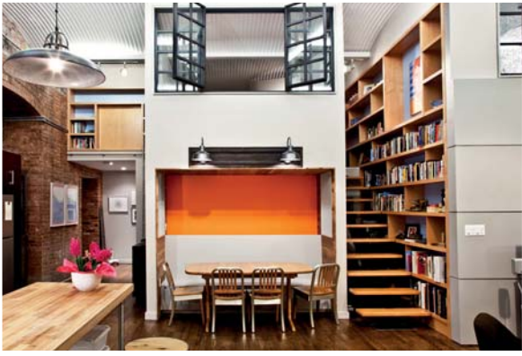
Former printing press turned loft by Design42 Architecture